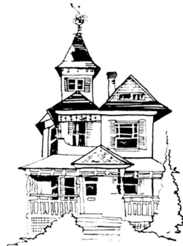
Drawing by Eleanor Oliver

Read Save the Dates on page 2 for information on upcoming programs and events.