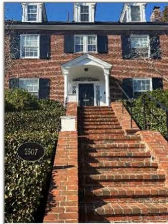
3507 Lowell Street.