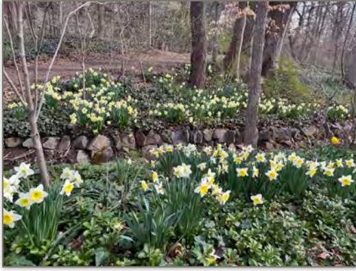
Springtime in Tregaron.

invasives to spread more rapidly. We have increased the pace of our invasives removal and native plant additions, as a result.