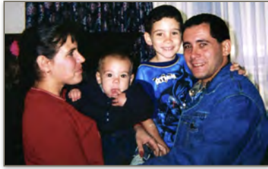
Elian Gonzalez, second from right, with his family.

Among Rosedale’s many iterations over the decades, perhaps the most notable in its history was when it was the home to the organization Youth for Understanding (YFU), which housed Elian Gonzalez, the six-year-old Cuban refugee, in 2000. How did that come to be? It is a complex story—this is the short version, based on many reports in the press.