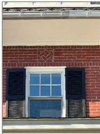
3601 Lowell Street.