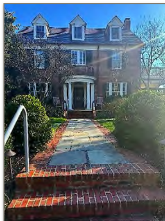
3414 Lowell Street.

For anyone who has walked the three-block stretch of Lowell Street NW between 34th Street and Wisconsin Avenue, the architecture is anything but uniform. Tudor revivals, bungalows, and foursquares sit comfortably alongside one another, reflecting the eclectic tastes of the developers who built out this section of Cleveland Park between roughly 1910 and 1930. But threaded through the mix is a recurring type that gives the block an air of formality: the Georgian Revival.