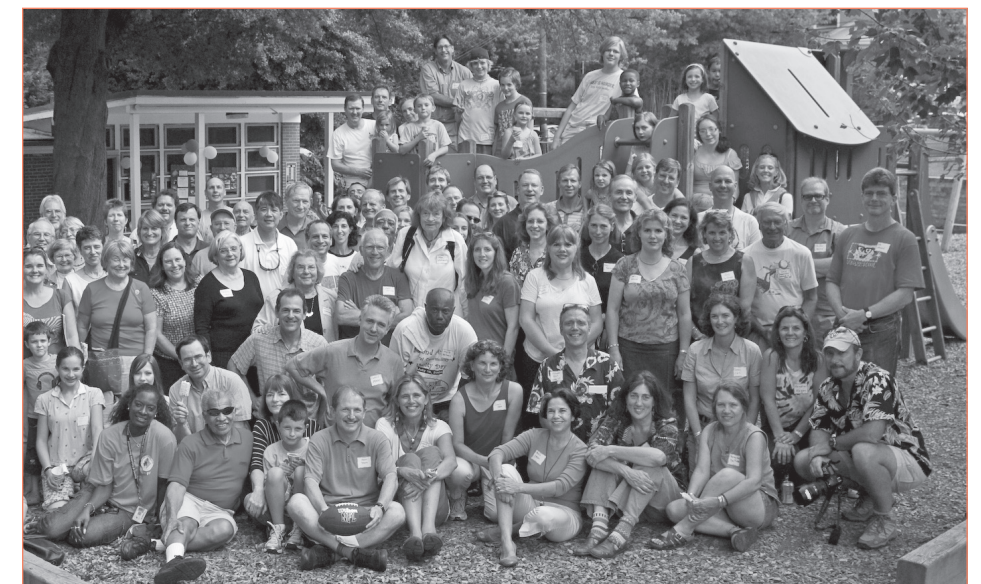
SEE ANYONE YOU KNOW? More than 100 "old" playmates gathered for a Macomb Playground reunion in September.

Renovations of Macomb Park (ROMP), the CPHS subcommittee that is dedicated to the upkeep and maintenance of the park, is hopeful that