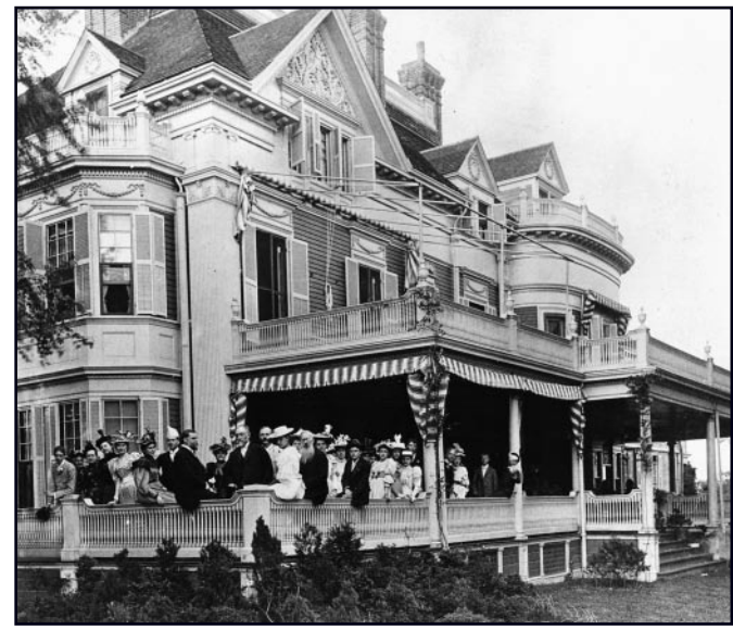
PICTURE WINDOWS The CVS historical photo display includes Twin Oaks, ca. 1890.