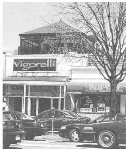
Vigorelli Restaurant erected a conservatory-like rooftop dining room without a building permit.

Unfortunately, within about a year, the owners added an unapproved enclosure to the deck without obtaining a building permit. Historic Preservation Inspector Toni Cherry cited the