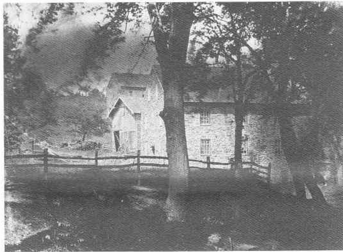
Taken by Titian Ramsay Peale, the youngest son of famed portraitist Charles Willson Peale, this rare 1855 photograph shows Peirce Mill, including what is now the Rock Creek Gallery, and a third building since demolished. The negative is in the collection of the Smithsonian National Museum of History and Technology.