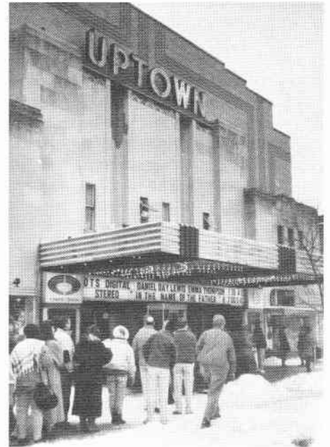
The Uptown is a big draw on a wintry Saturday.

Allen explains that exploding movie production and distribution costs make most large theaters unprofitable, but the Uptown, because of its setting and area, has "marketability." Distributors—who split gross proceeds 65/35 with the theater over the first weeks of a film's run—know the Uptown can guarantee them $60,000 a weekend at first. "Distributors like 20th Century Fox approach us, rather than the other way round," he says. (Usually, I learned, theater chains must compete—and pay—for distribution rights.) With its size and discerning clientele—"We wouldn't play House Party here"—