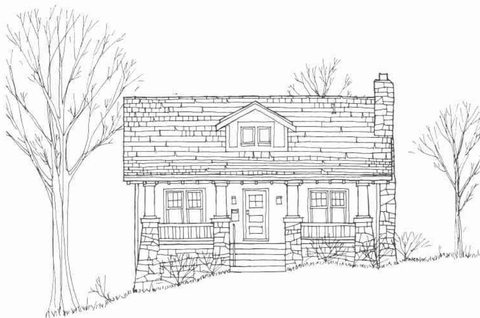
The charming, unpretentious Bungalow reflects the Craftsman ideals of "honesty" in building. Most Cleveland Park examples were built in different styles from 1907 to 1925. Drawing by John Wiebenson.