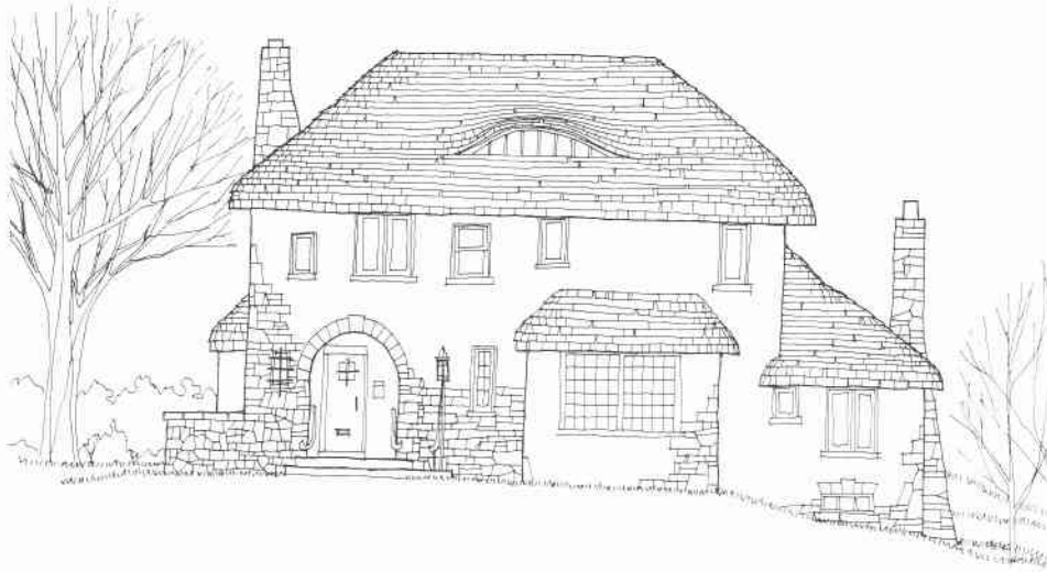
The Thatched Cottage has a bucolic, romantic air, with its upholstered roof and play of both symmetry and non-symmetry. Cleveland Park's two examples were built in the 1920s. Drawing by John Wiebenson.